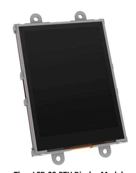
The uLCD-28-PTU Display Module