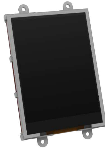
The uLCD-32-PTU Display Module