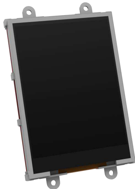
The uLCD-32-PTU Display Module