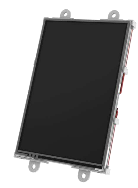
The uLCD-35DT Display Module

NOTE (*): Arduino remains the property of the Arduino Team. All references to the word Arduino and Arduino Hardware are licensed under the Creative Commons Attribution Share-Alike license.