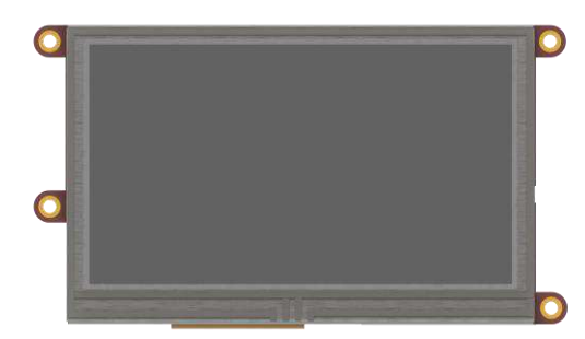
The uLCD-43DT Display Module