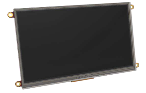
The uLCD-70DT Display Module