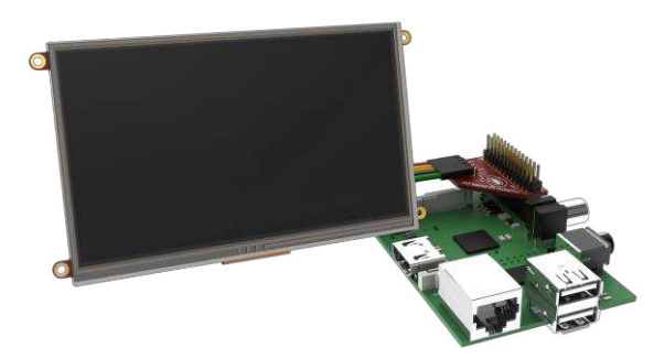
The uLCD-70DT-PI Pack connected together (Note: Raspberry Pi NOT included)