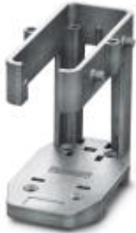
HEAVYCON plug assembly frame, lower part for double locking latch, for sleeve housing with double locking latch or HC-CIF..HFFD..., for type B16 contact inserts

Please be informed that the data shown in this PDF Document is generated from our Online Catalog. Please find the complete data in the user's documentation. Our General Terms of Use for Downloads are valid ( http://download.phoenixcontact.com )