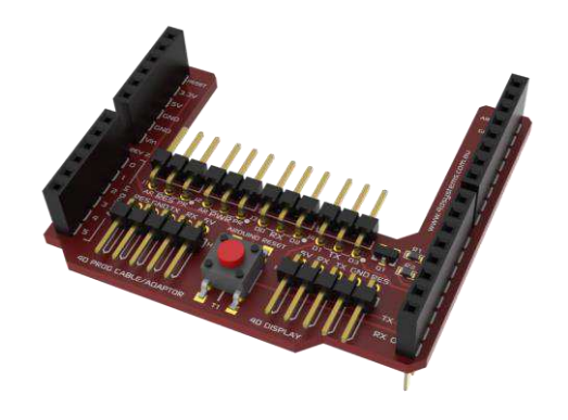
4D Arduino Adaptor Shield

For a detailed listing of the capabilities of the display module in this Arduino Pack, please refer to the datasheet for the display itself, available from the 4D Systems website, www.4dsystems.com.au.