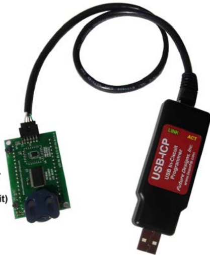
Example User Target Board (Not Part of Kit)

The target connector is a standard 2mm pitch, 10-pin, shrouded header available from numerous suppliers. Shrouded connectors should be utilized in order to protect the pins and ensure proper connector insertion.