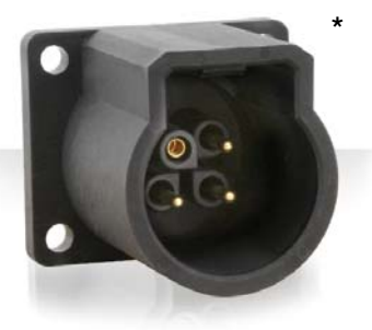
* Contact us for more information on mating receptacle offering