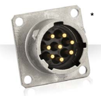
* Contact us for more information on mating receptacle offering