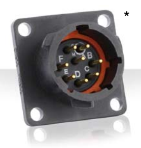
* Contact us for more information on mating receptacle offering