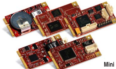
Mini PCIe Modules