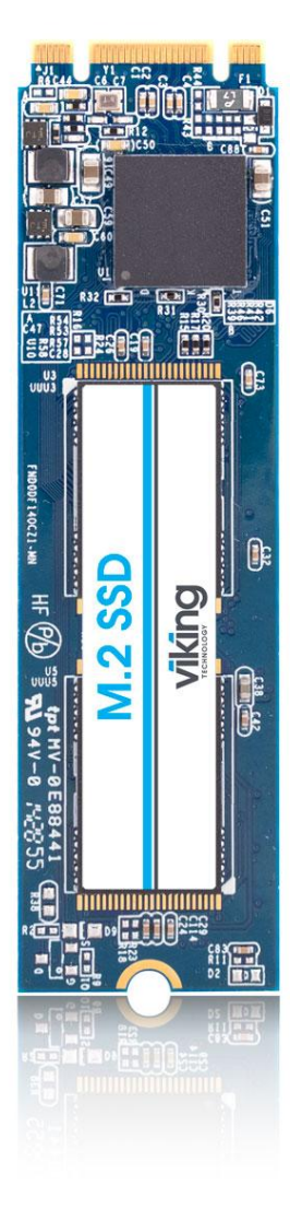
M.2 2280 FRONT