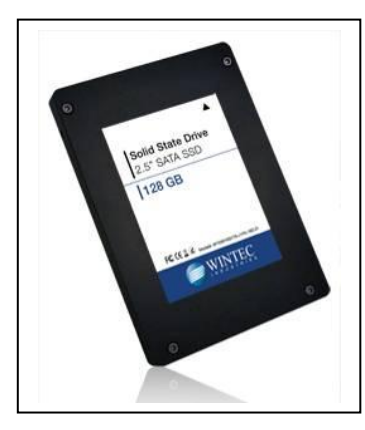
Wintec Solid State Drive