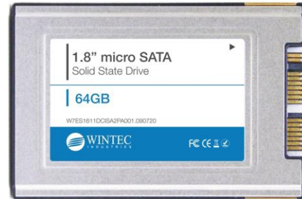
Wintec Solid State Drive