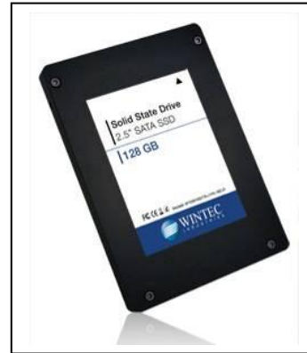
Wintec Solid State Drive