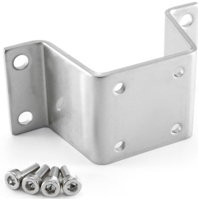
Bracket, with 4 pcs of M3 A2 screws

Wall bracket used with Low Pim Power Splitters in 2 Way, 3 Way and 4 Way models.