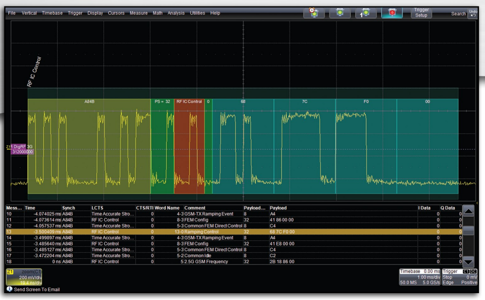
View an entire DigRF 3G burst using intuitive decoding and table display. Click the table to view a zoom of a particular packet.

The DigRF 3G and v4 decode are the ideal tools for powerful system level protocol debug as well as problem solving for signal quality issues. The DigRF decodes add a unique set of tools to your oscilloscope, simplifying how you design and debug MIPI digital RF systems.