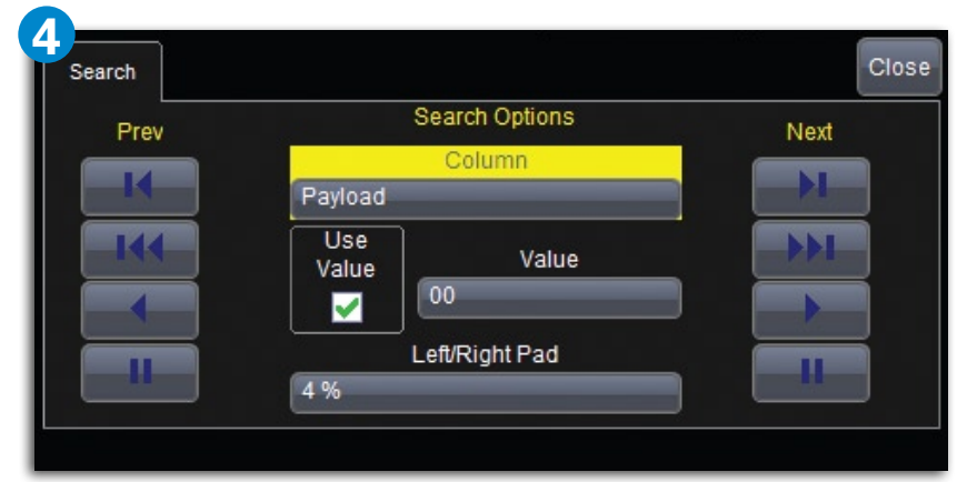
Search can locate up to 14 selectable criteria for DigRF 3G and 18 criteria for DigRF v4, or narrow down the search by entering a value.