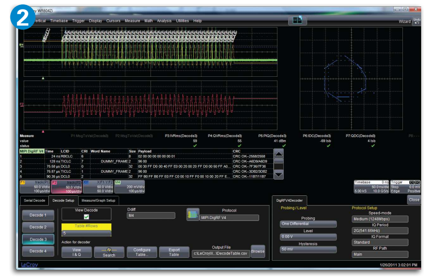
DigRF v4 Constellation diagram shows information such as gaussian noise, Phase noise, and attenuation.