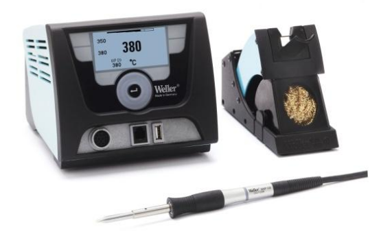
WX 1 control unit with WXP 120 (120 W / 24 V) soldering pencil and WDH 10 safety rest