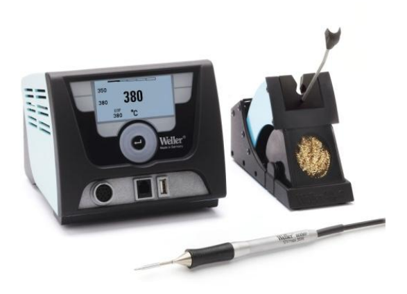
WX 1 control unit with WXMP Micro soldering pencil (40W / 12V) and WDH 50 safety rest