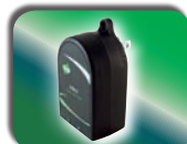
SE Range Extenders