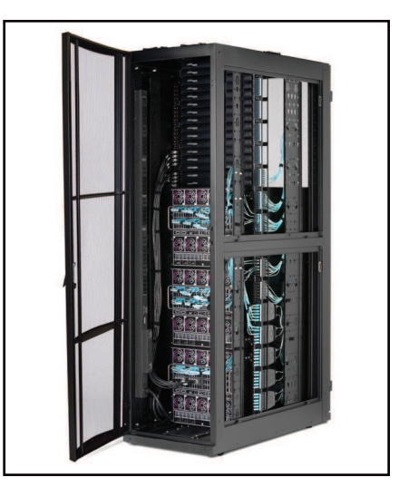
Belden Zero U - Vertical patch panel allows for optimal use of mounting space into XS Series enclosures by providing high-density connectivity options along the equipment mounting rails.