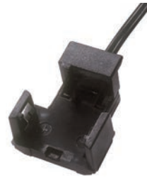
Lead Acid Clip