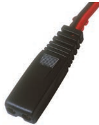
2-Pin Plug Connector

Contact our factory for details on how to place an order and to specify assembly options.