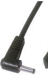
DC Plugs- Right Angle