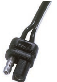
2-Pin Auto Connector

Contact our factory for details on how to place an order and to specify assembly options.