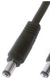
DC Plugs- Straight