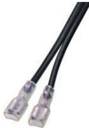
Terminals, Spades and Lugs