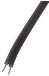
Tinned/Stripped Wires and Cords