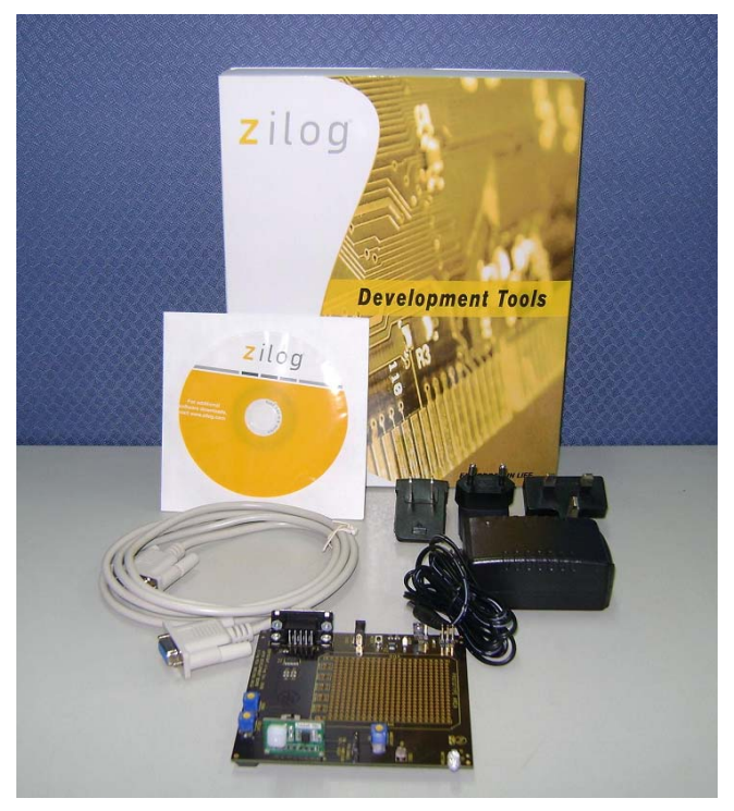
Figure 1. ZMOTION Detection Module Evaluation Kit Components