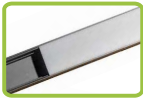
ZFC-17 SERIES Milk White Lens