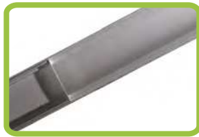
ZFC-17 SERIES Semi-Clear Lens