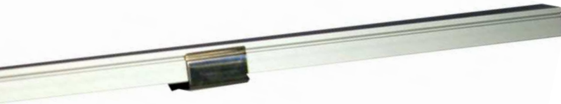
ZFC-17 SERIES - SIDE VIEW