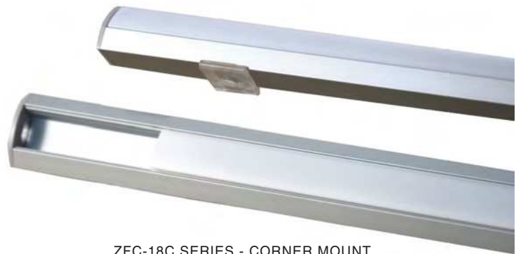
ZFC-18C SERIES - CORNER MOUNT